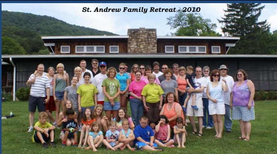
St. Andrew Family Retreat - 2010

Registration packets will be in churches soon!